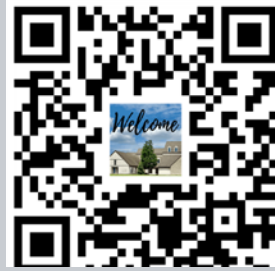
Donate to Saint Joan of Arc