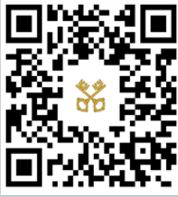
Donate to Saint Peter

The financials were unavailable at the time of printing.