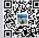
Donate to Saint Joan of Arc